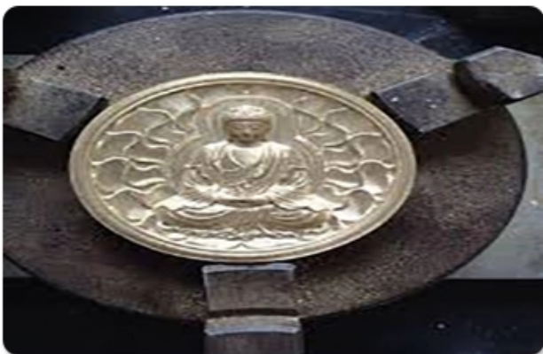
metal relief carving